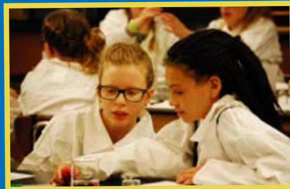
STEM grants impact learning!