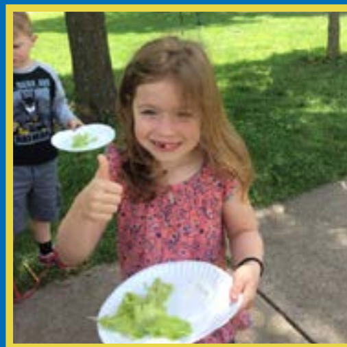
Science and Environmental Grants inspire young minds!