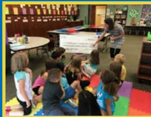
Duke Energy's support to the Super Power Reading Camp helped kids keep reading during the summer!